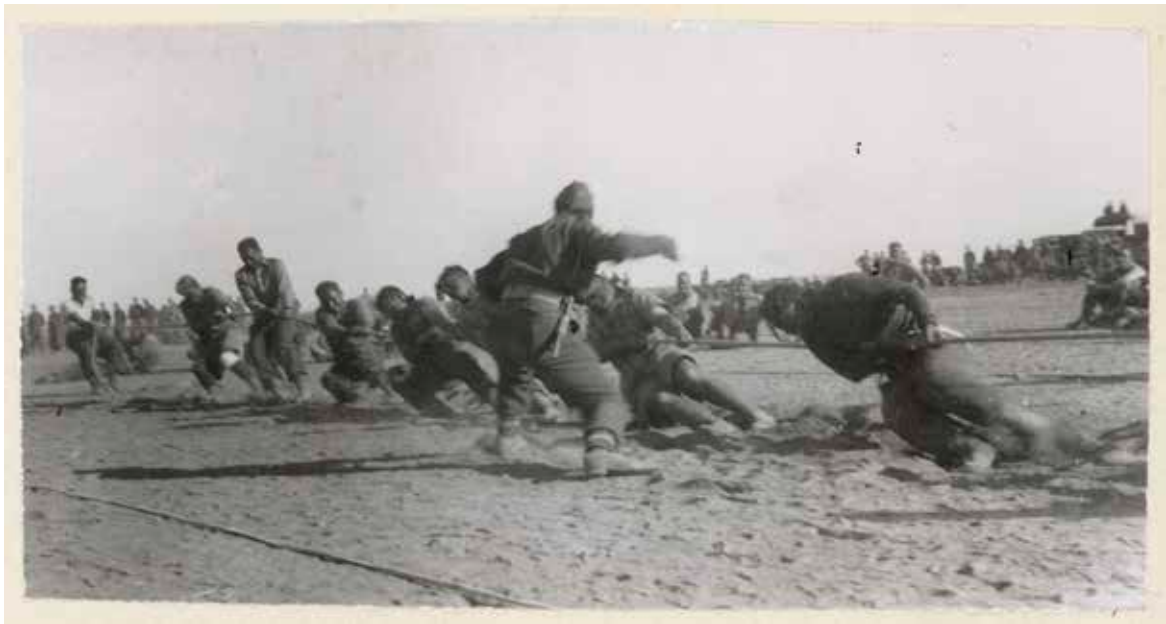
Māori Battalion winning a tug-of-war, near Bardia, Libya - New Zealand. Department of Internal Affairs. War History Branch: Photographs relating to World War 1914-1918, World War 1939-1945, occupation of Japan, Korean War, and Malayan Emergency. Ref: DA-11367. /records/22836800