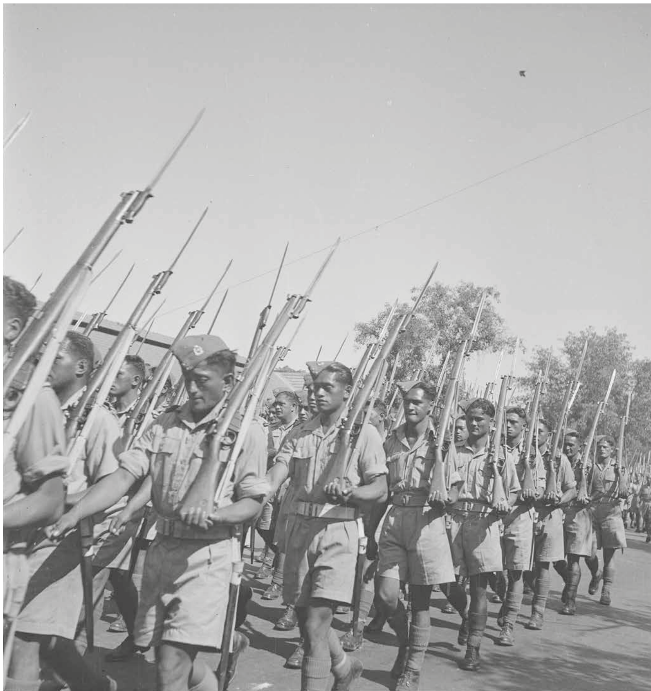
Members of the 28th New Zealand (Māori) Battalion marching in United Nations Day Parade, Cairo - New Zealand. Department of Internal Affairs. War History Branch: Photographs relating to World War 1914-1918, World War 1939-1945, occupation of Japan, Korean War, and Malayan Emergency. Ref: DA-04172-F.