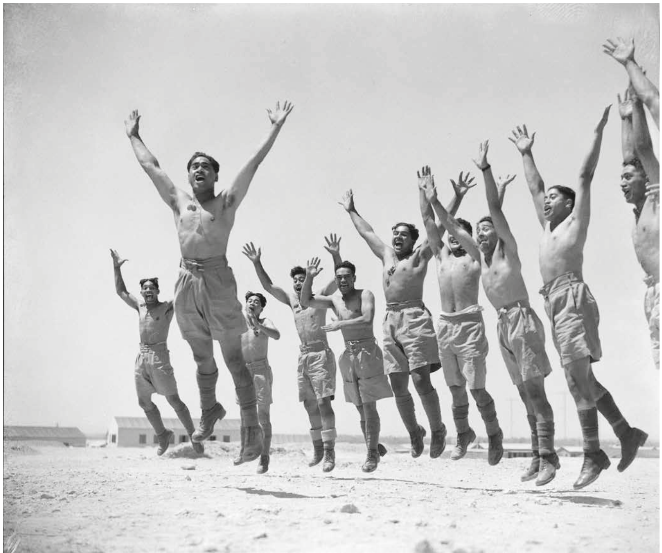
Members of the Māori Battalion performing a haka, Maadi, Egypt. New Zealand.