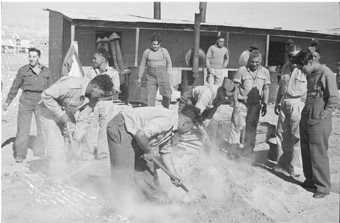
Uncovering the Christmas hangi at the Māori Training Depot, Maadi Camp, Egypt