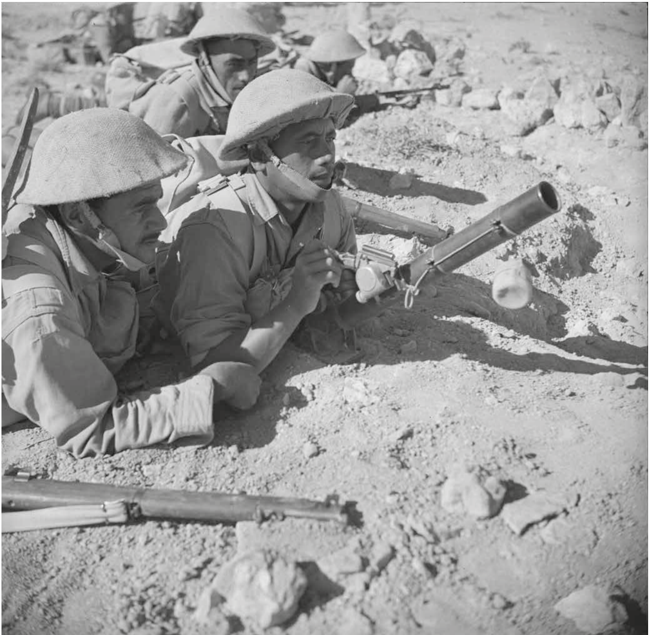
Member of the Māori Battalion using a 2 inch mortar during manoeuvres, Western Desert, Egypt.