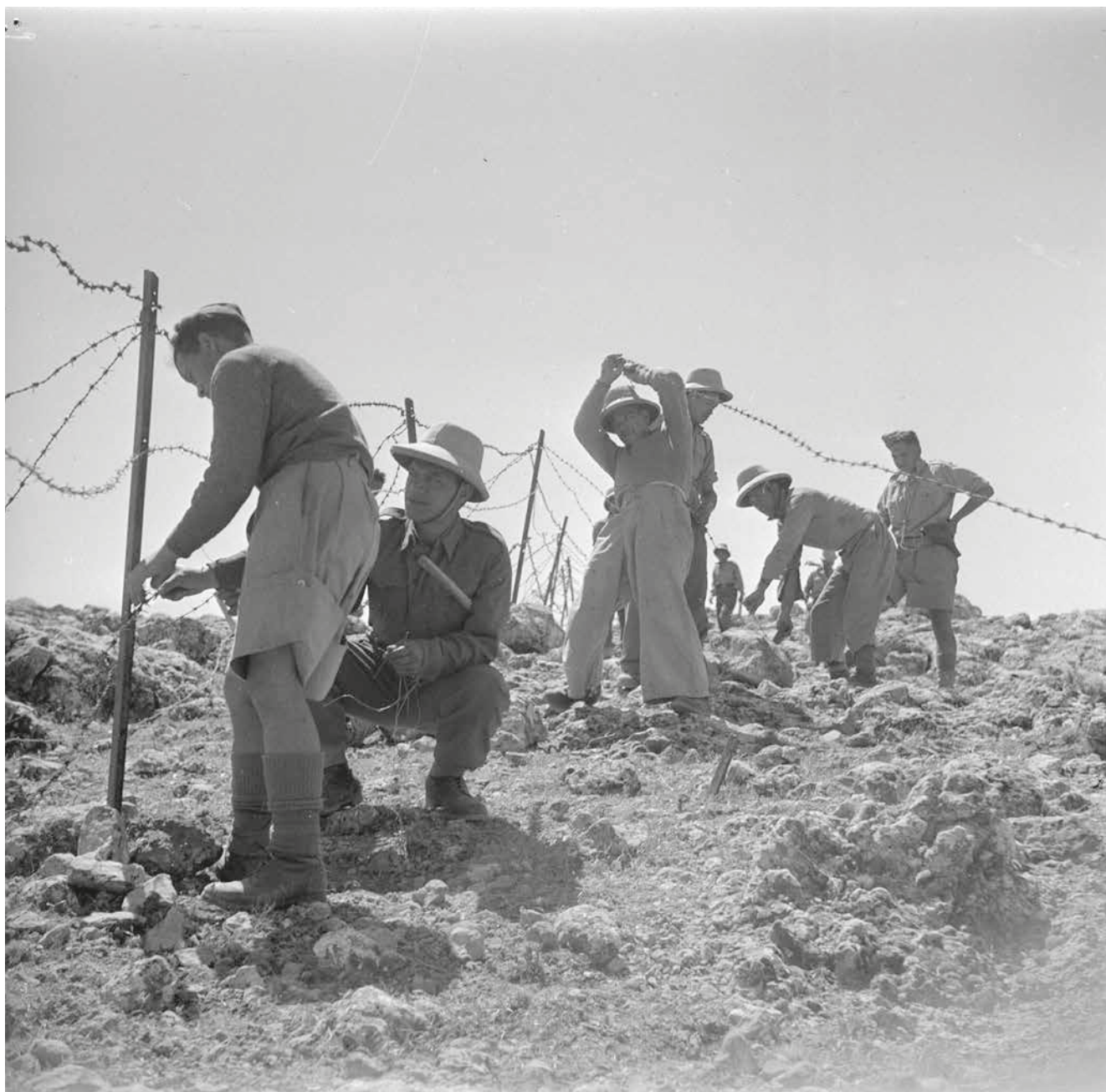
Members of 28 New Zealand Māori Battalion erecting wire fences in Syria during World War II