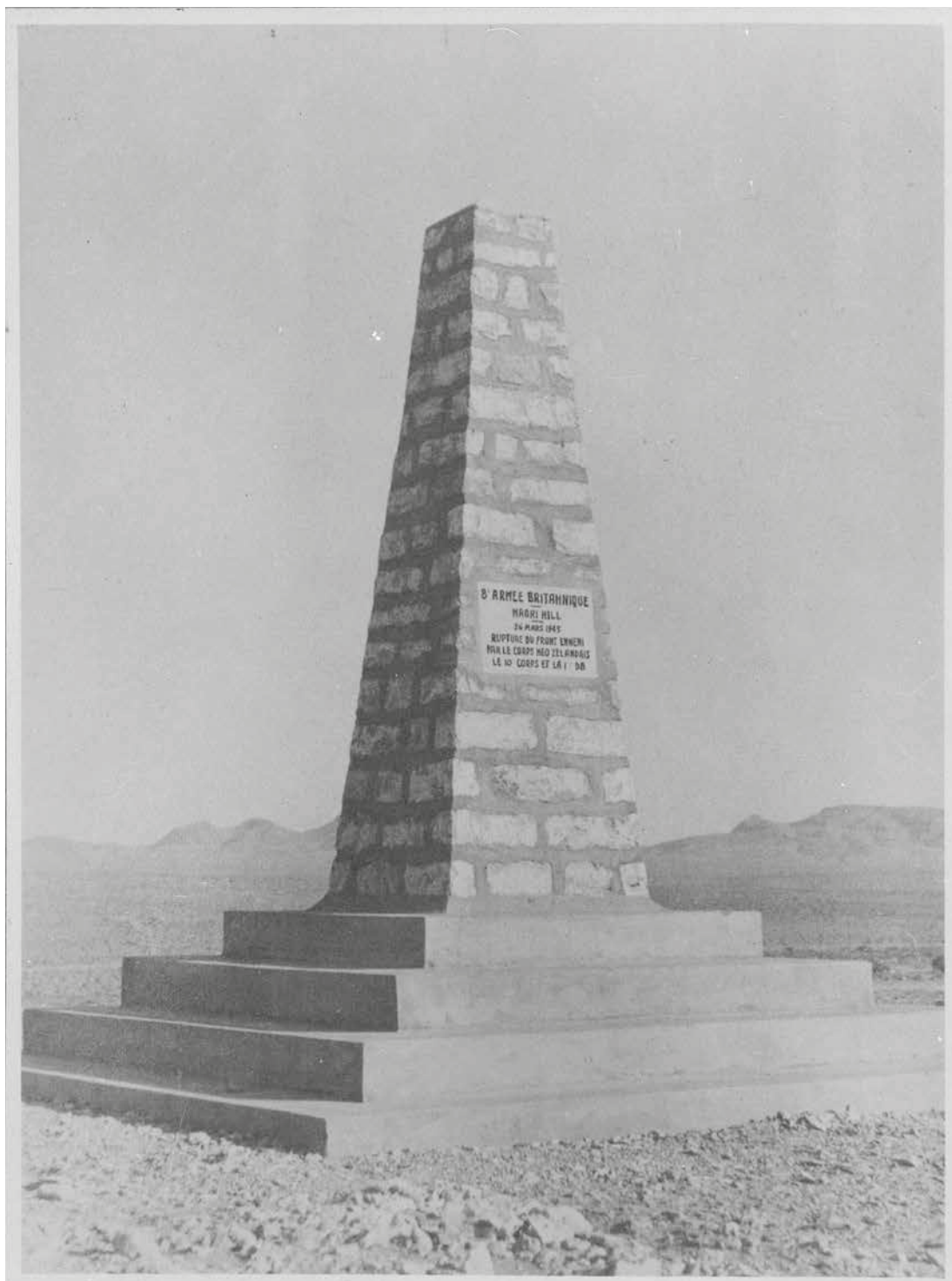
Monument at 'Maori Hill' (Pt 209), Tebaga Gap, Tunisia.