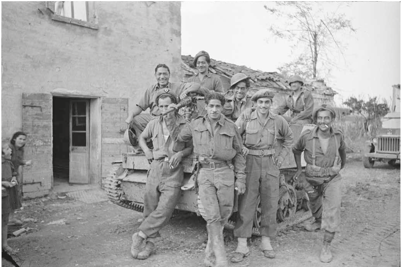
Crew of a 28th New Zealand (Māori) Battalion Bren carrier, waiting to move up to front lines from Gambettola, Italy - New Zealand. Department of Internal Affairs. War History Branch: Photographs relating to World War 1914-1918, World War 1939-1945, occupation of Japan, Korean War, and Malayan Emergency. Ref: DA-07700-F.