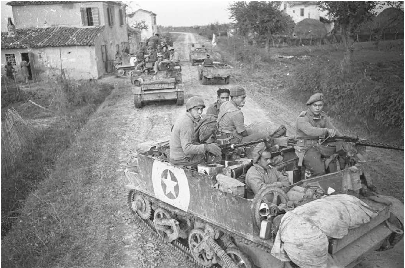
Bren carriers of the Māori Battalion in Italy.