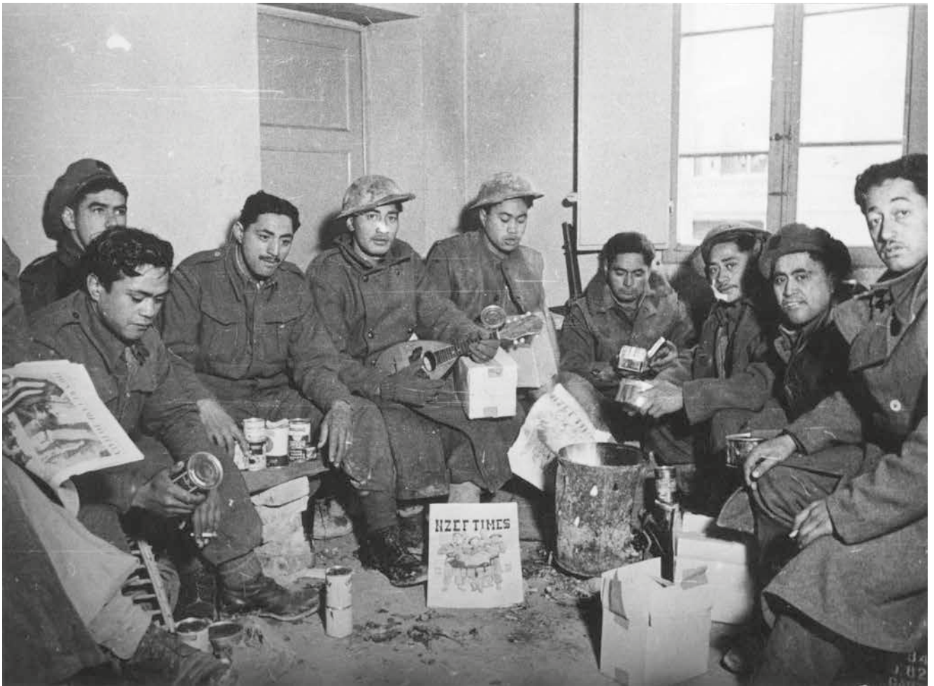
Māori Battalion members unwrapping their Christmas patriotic parcels in a forward area, Faenza, Italy. New Zealand. Department of Internal Affairs. War History Branch: Photographs relating to World War 1914-1918, World War 1939-1945, occupation of Japan, Korean War, and Malayan Emergency. Ref: DA-07987-F.