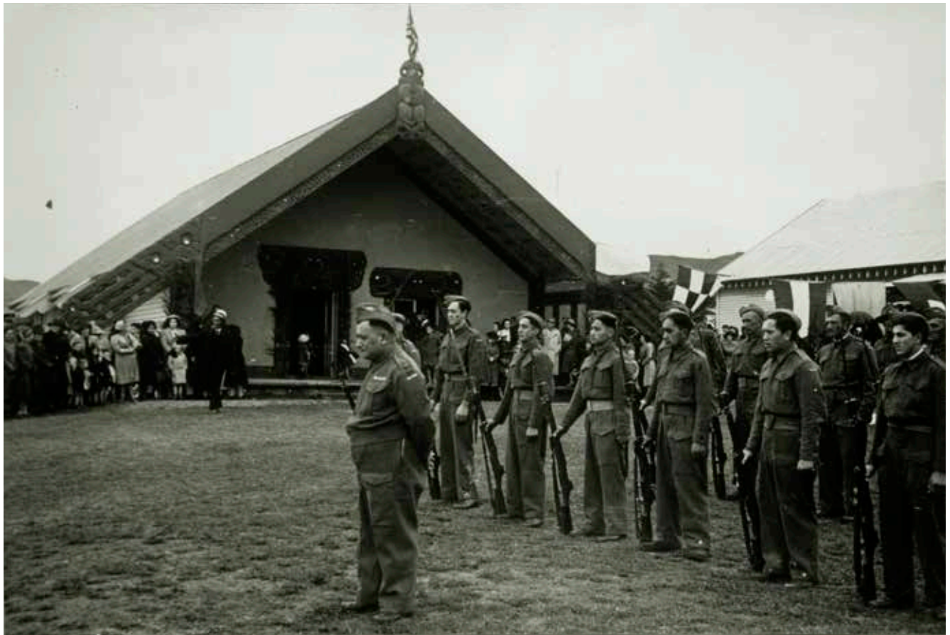
Second Māori Battalion at Ruatoria for the posthumous award of the Victoria Cross to Te Moananui-a-Kiwa Ngarimu - New Zealand. Department of Internal Affairs. War History Branch :Photographs relating to World War 1914-1918, World War 1939-1945, occupation of Japan, Korean War, and Malayan Emergency.