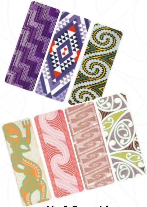
Ngā Tauaki Marautanga