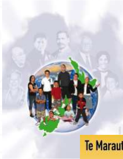
Te Marautanga o Aotearoa