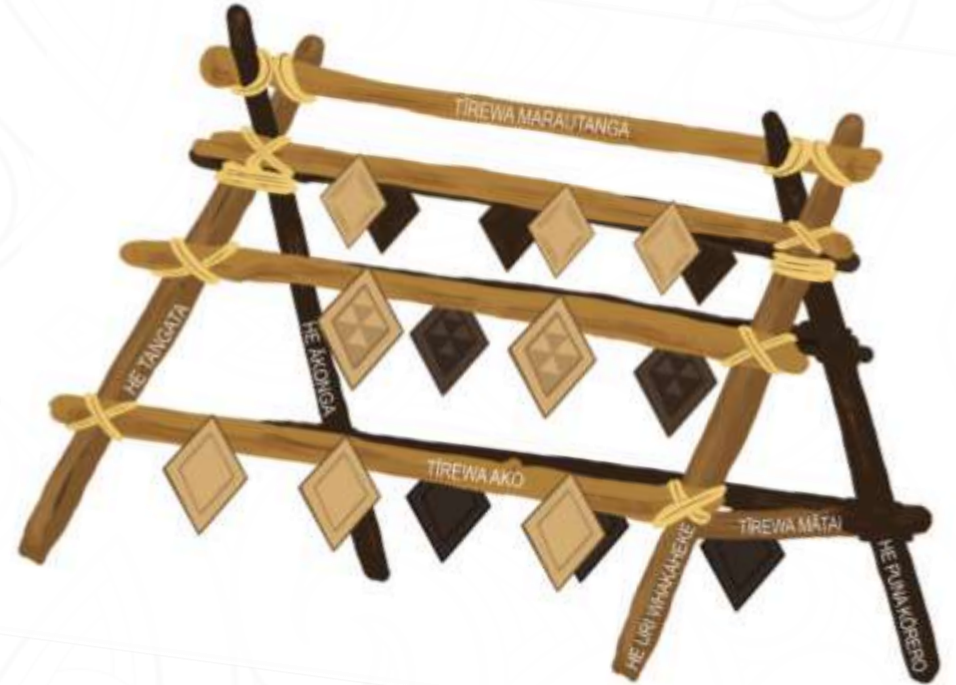
Te Tirewa Marautanga o Aotearoa